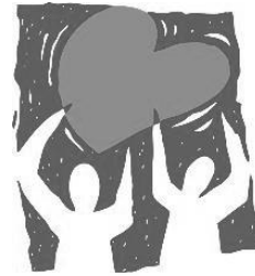
Unbinding Your Heart

Have you ever wondered how to invite someone to church? Have you ever wanted to know just the right thing to say about your faith? Have you ever longed for a better prayer life? Join us in the Lenten study Unbinding Your Heart . Adults and teens will meet each Sunday, March 4-Easter Day at 9 am. Or, you may choose to meet with the Wednesday evening class at 6 pm beginning March 7. Please sign up so that we can order enough books.