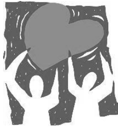
Unbinding Your Heart

Have you ever wondered how to invite someone to church? Have you ever wanted to know just the right thing to say about your faith? Have you ever longed for a better prayer life? Join us in the Lenten study Unbinding Your Heart . Adults and teens will meet each Sunday, March 4-Easter Day at 9 am. Or, you may choose to meet with the Wednesday evening class at 6 pm beginning March 7. Please sign up so that we can order enough books.