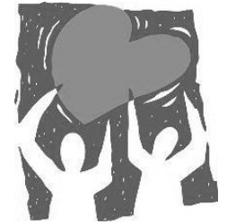
Unbinding Your Heart

Have you ever wondered how to invite someone to church? Have you ever wanted to know just the right thing to say about your faith? Have you ever longed for a better prayer life? Join us in the Lenten study Unbinding Your Heart . Adults and teens will meet each Sunday, March 4-Easter Day at 9 am. Or, you may choose to meet with the Wednesday evening class at 6 pm beginning March 7. Please sign up so that we can order enough books.